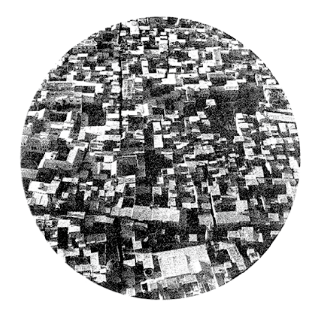
Figure 3. Photograph of the ancient section of the city of Damacus. Weingart took this picture in 1966 and noticed that its texture resembled to some of his typographical compositions (see Figure 2 and [7]).