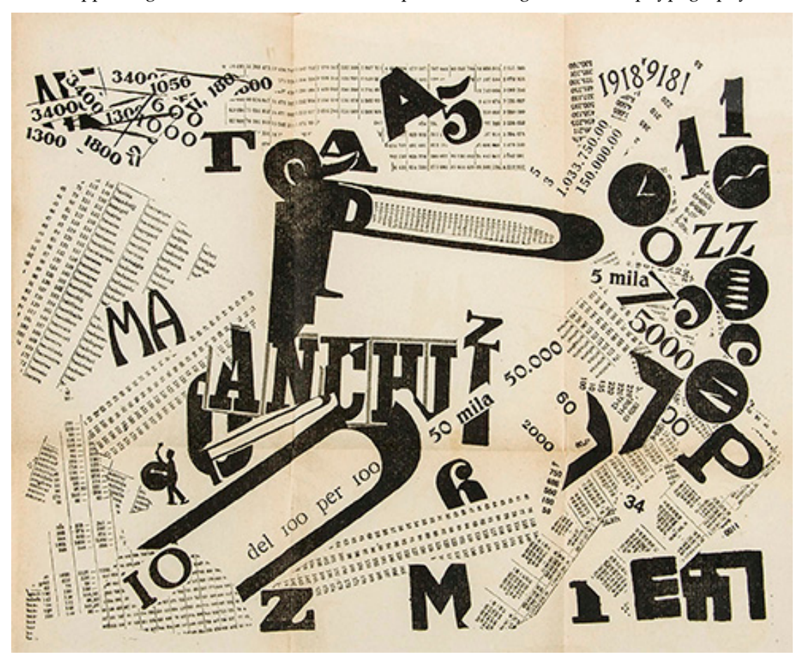
Figure 1. Detail of a spread. Filippo Tommaso Marinetti, Les Mots en Liberté Futuristes , Edizioni futuriste di "Poesia": Milan, Italy, 1919.

Following these two above-mentioned titles, futurists started to experiment with the book as a medium of art as well as the container of their manifestos, producing several well-known experimental books. The books published by Edizioni Futuriste di Poesia — Poesia Futurist editions and the literary style of the words-in-freedom embodied how the spreads and pages were changing at that time, appearing as individual units and as sequences of images made of up typography.