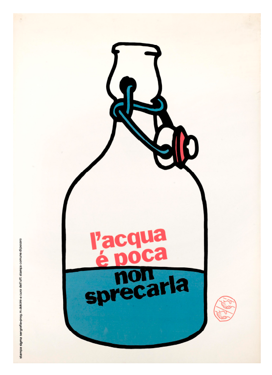
Figure 4. "l'acqua è poca non sprecarla", Massimo Dolcini, ca. 1970.